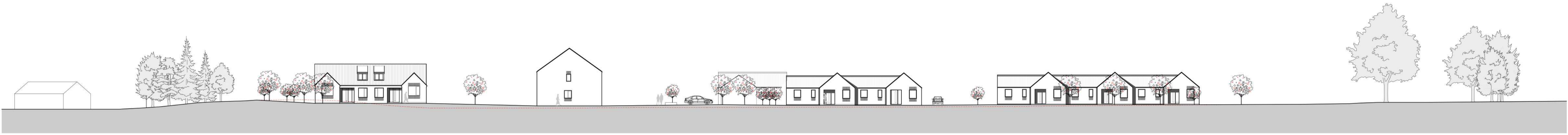
PROPOSED SECTION A-A scale 1:300