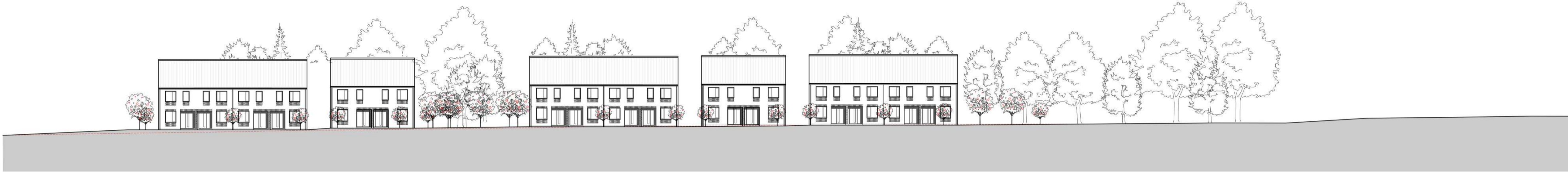
PROPOSED SECTION C-C scale 1:300