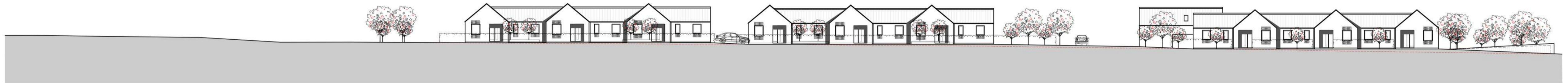
PROPOSED SECTION D-D scale 1:300