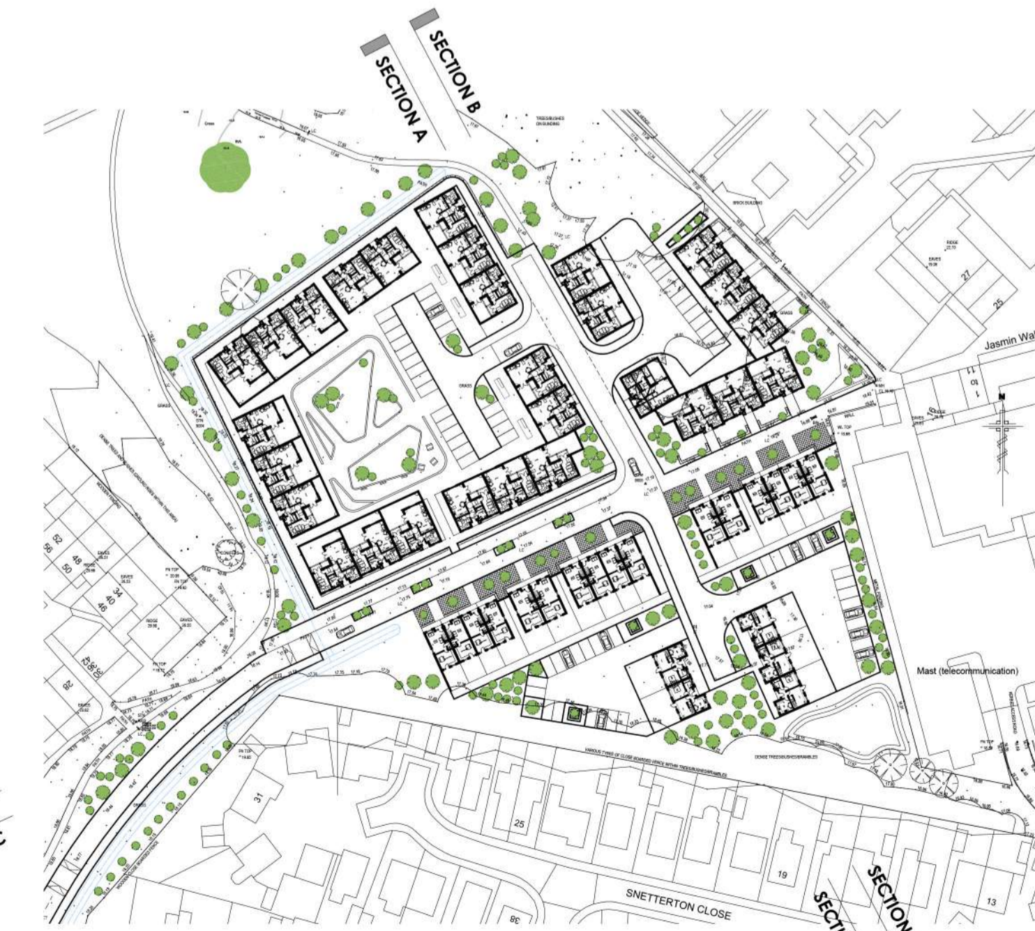
SECTION REFERENCE PLAN scale 1:1250